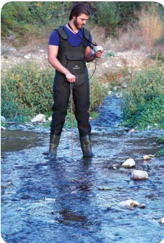
Measuring water velocity in the small river.

TÜV We are certified ISO 9001:2008 Certificate No. 01 100 072276 Quality is our standard