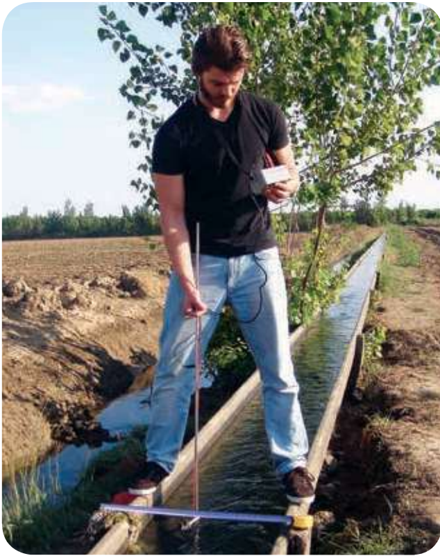
Measuring water velocity in the small canal.