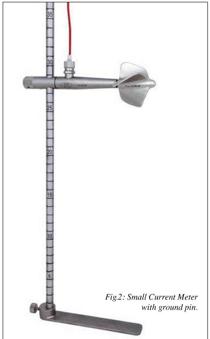
Fig.2: Small Current Meter with ground pin.