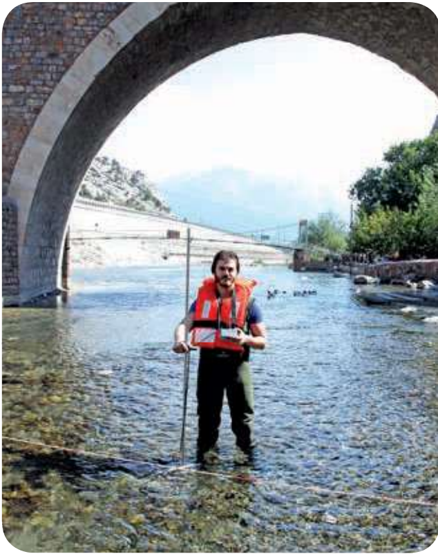
Measuring water velocity in the big river.