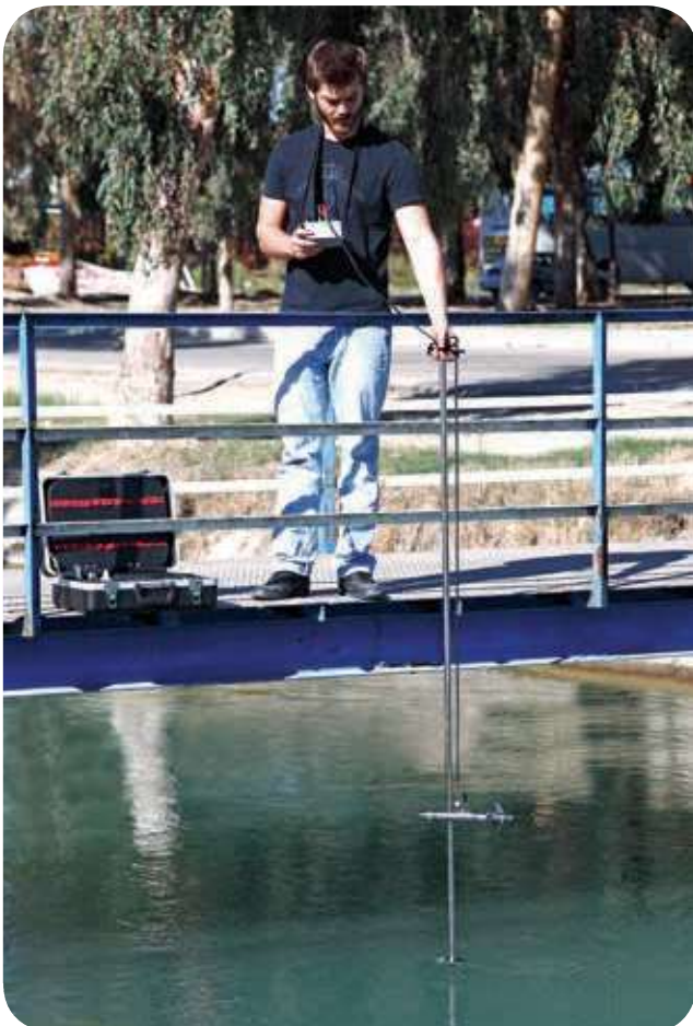
Measuring water velocity in the big channel